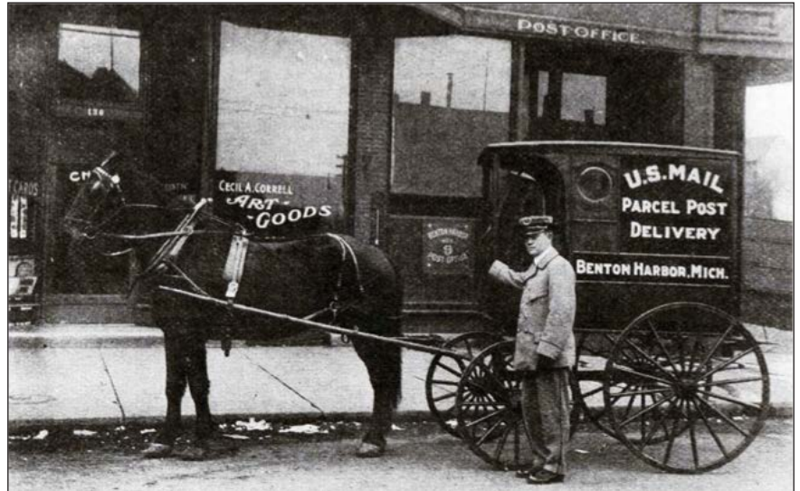
From the Archives: “Parcel Post wagon in Benton, Harbor, Michigan.”

When RFD introduced daily mail wagons to rural areas, some carriers began to