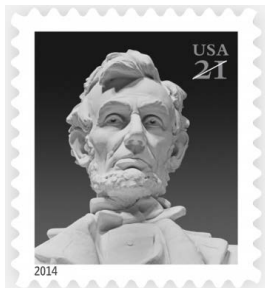
Lincoln Memorial Statue