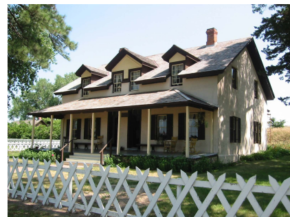
Captain's Quarters, the real Fort Hartsuff, Burwell, Nebraska ( www.forthartsuff.org )