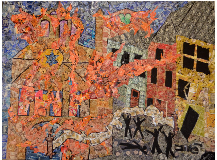
Kristallnacht: Students reimagined The Night of Broken Glass in this piece depicting the Nazi powers' persecution of Jews in Germany in the pogrom of Nov. 9–10, 1938. The project's description notes, "Hollow outlines of human figures honor the memories of those who were killed on the spot or marched off to a concentration camp." A desecrated Torah winds across the piece's lower portion.

wide range of themes depicted—people, world history, places, flora and fauna, inventions, ideas, and values—leads to discussions about what makes our