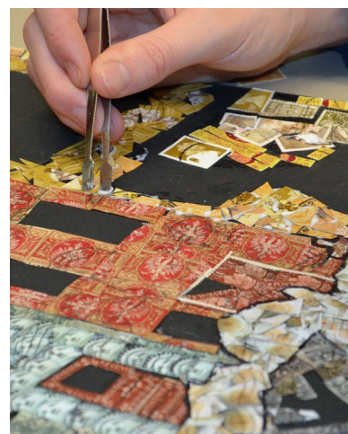
Hand at Work: Tongs, glue, and an artistic eye combine to create art.

Now six years in the works, "The Holocaust Stamps Project provides opportunities for students to gain a deeper understanding of how important it is to demonstrate acceptance, tolerance, and respect for diversity in their own daily lives. As they trim and count the thousands of stamps that arrive at the school from across the country, the