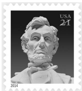
Lincoln Memorial Statue