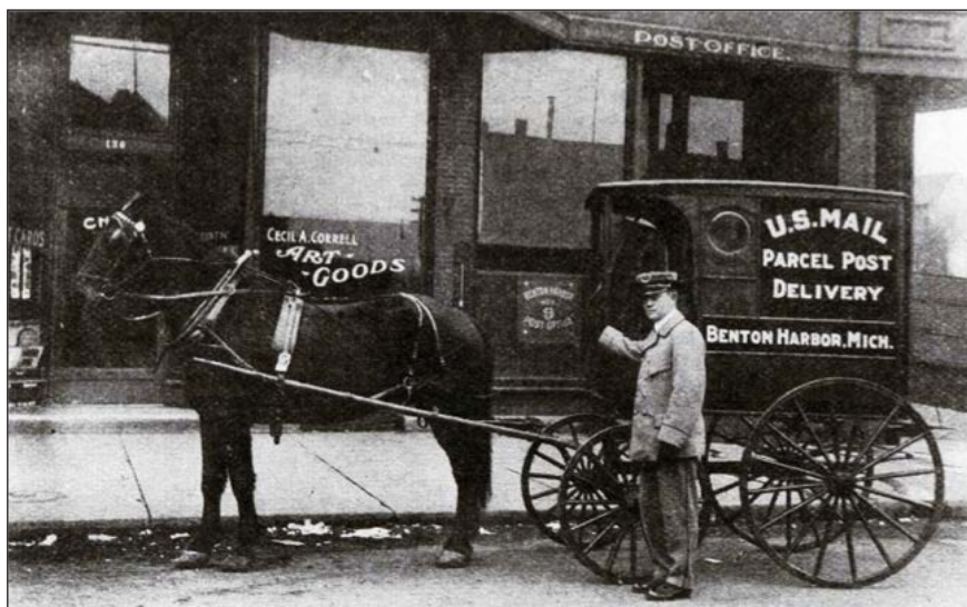
From the Archives: “Parcel Post wagon in Benton, Harbor, Michigan.”

When RFD introduced daily mail wagons to rural areas, some carriers began to