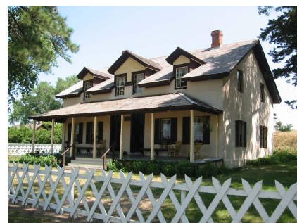
Captain's Quarters, the real Fort Hartsuff, Burwell, Nebraska ( www.forthartsuff.org )