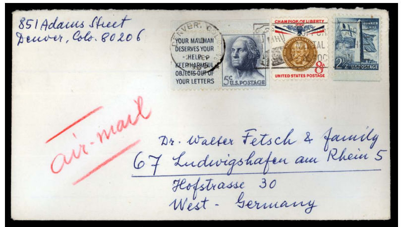
Last Champion of Liberty: The 8¢ Mahatma Gandhi issue of 1961.

So, the question is this: if the 8¢ Gandhi issue appeared on a letter four and two-thirds years after its release, was this an in-period usage? My first hunch was that the use occurred a bit long after release to be normal usage. Perhaps the letter was correspondence between