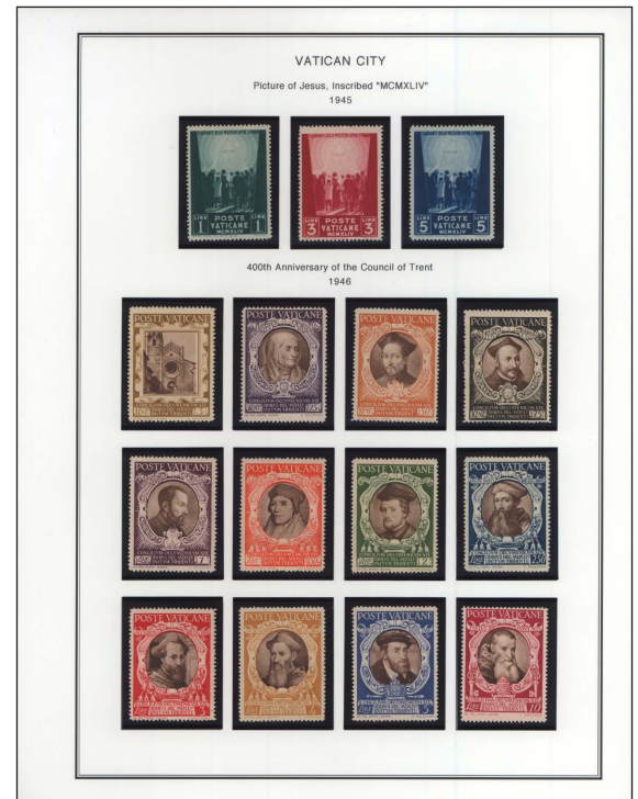
Album Sample: A Vatican City page.