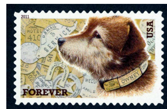
Not Owney, the Postal Dog!

More Info: about.usps.com/news/national-releases/2014/pr14_032.htm