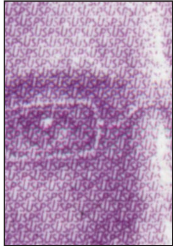
Microprinting to the Max: Countless repetitions of "USPS" combine to form the stamp's portrait.

Perhaps its most unusual feature is the one illustrated in the enlargement to the right. The issue's frame and lettering are printed in solid tones, but the vignette, while appearing