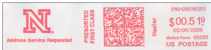
Hasler: Presorted first class, nonautomation presorted, not over 2 oz., with corporate logo.