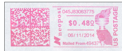
Neopost: First class, single piece.