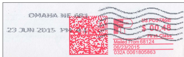
Francotyp-Postalia: First class, single piece.