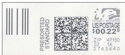
Pitney Bowes: Presorted standard.