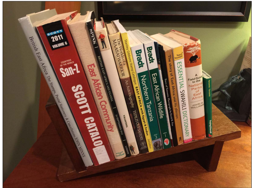
On the Shelf: A collection of reference books represents the fruits of a month-long search for materials to support collecting the stamps and postal history of Tanzania and its predecessors.

Postal History Books: British East Africa: The Stamps, Postal Stationery & Cancellations ; East Africa: The Story of East Africa and Its Stamps ; and The Postal History of Tanganyika: 1915–1961 . Books like these provide access