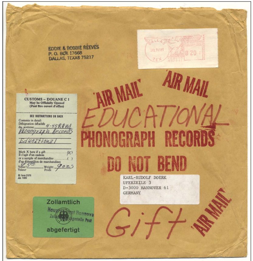
Insured Air Mail —Dallas, Texas, to Hannover, Germany, July 31, 1985. The cover's given information does not account fully for the $8.20 postage paid.