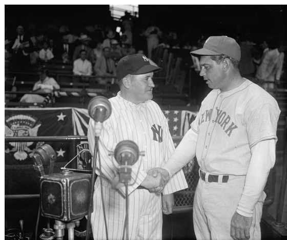
All-Star Skippers —Joe McCarthy (left) and the Giants' Bill Terry (right) before the 1937 All-Star game.