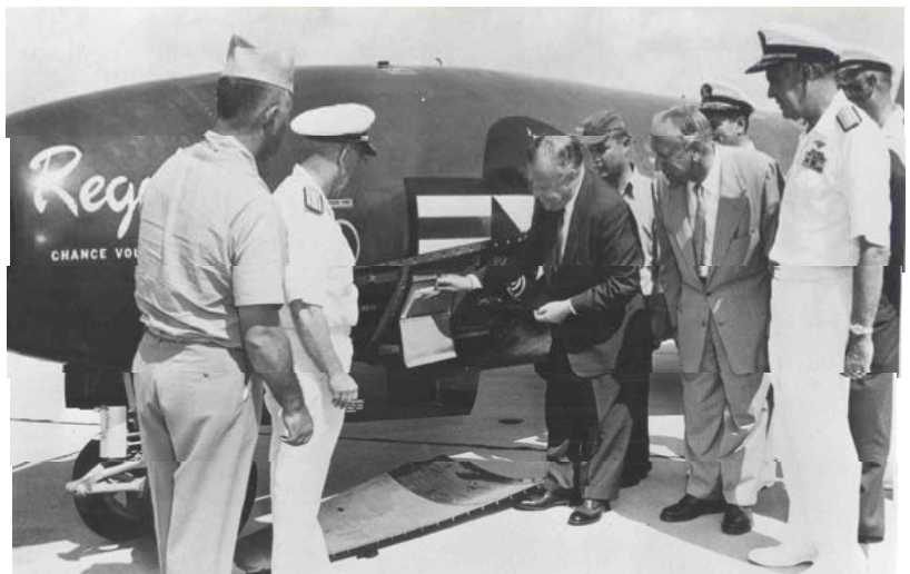
Postmaster General Arthur E. Summerfield unloads mail from a Regulus guided missile at the Mayport Naval Auxiliary Air Station near Jacksonville, Florida.

U.S. Navy photo; collection of United States Postal Service