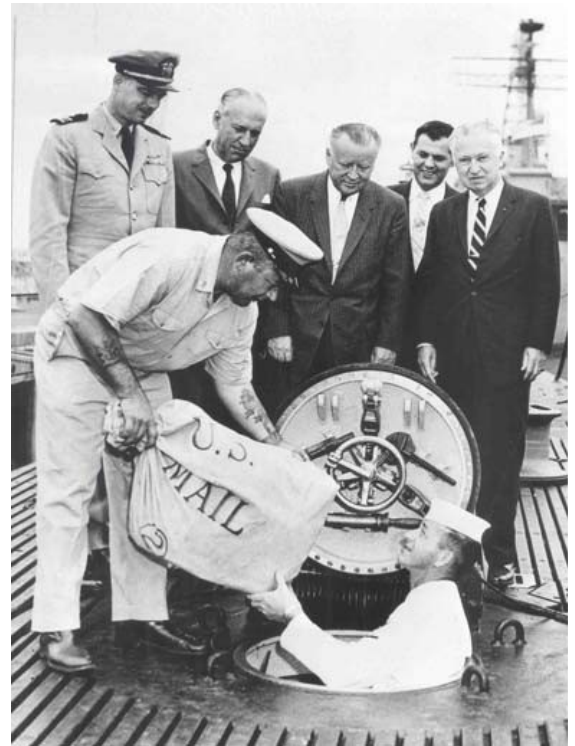
Postmaster General Arthur E. Summerfield (rear center) looks on as mail is loaded onto the USS Barbero in Norfolk, Virginia, in 1959.

The 1959 event was widely-publicized as the "first official missile mail" to distinguish it from earlier rocket flights. The earliest known unofficial transportation by rocket of U.S. Mail took place on February 23, 1936, when two rockets transported mail about 2,000 feet across a frozen lake towards the Hewitt, New Jersey, Post Office, from Greenwood Lake, New York. The rockets crash-landed before reaching their destination and slid along the ice; the postmaster of Hewitt obliged by removing the two bags of mail and dragging them the rest of the way to the Post Office.