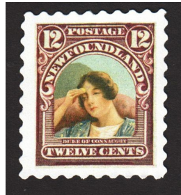
International Hangover Day August 4