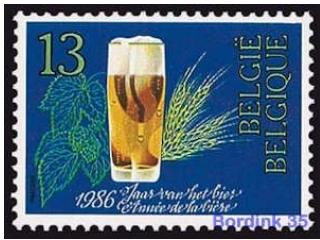
International Beer Day August 3