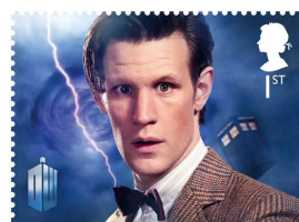
National Bow Tie Day August 28