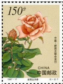
International Roses Day August 14