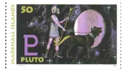
International Pluto Demoted Day August 24