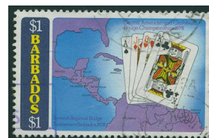
National According to Hoyle Day August 29