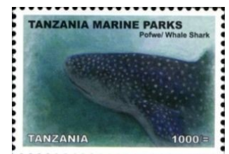
International Whale Shark Day August 30