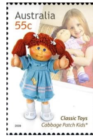
National Doll Day August 5