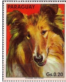
National Spoil Your Dog Day August 10