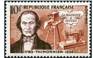
National Sewing Machine Day August 12