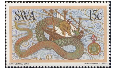
National Sea Serpent Day August 7