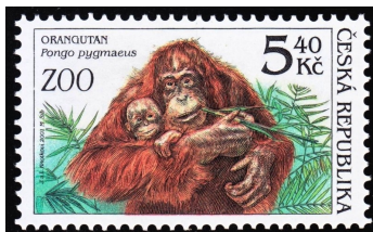
International Orangutan Day August 19