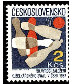
National Bowling Day August 11