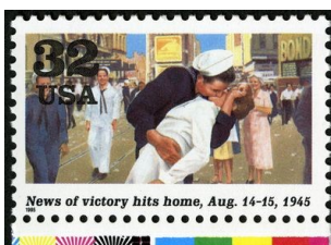
National Kiss and Make Up Day August 25