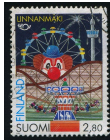
National Roller Coaster Day August 16