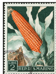
National Buttered Corn Day August 23