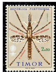
International Mosquito Day August 20