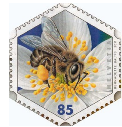
International Honey Bee Day August 18