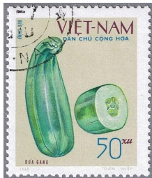
National Sneak Some Zucchini onto Your Neighbor's Porch Day August 8