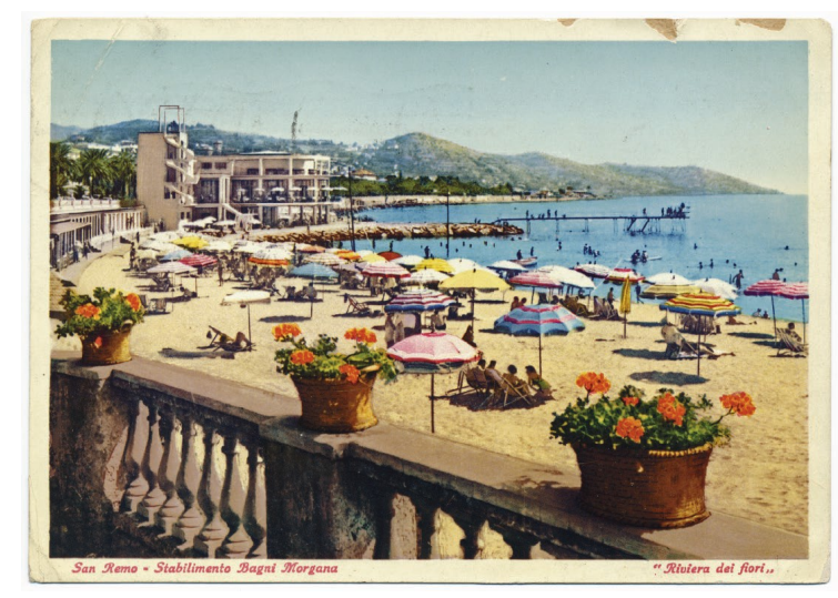
Stabilimento Bagni Morgana: A view of Morgana Beach.

A section of U.S. International Postal Rates, 1872–1996 , researched and written by Anthony W. Wawrukiewicz and Henry W. Beecher, includes a "Table showing rates/fees on incoming surface/airmail to United States, 1950–1971" (pp. 295–315). One of the entries for Italy (p. 303) notes a single post-card rate of 35 lire for the period from July