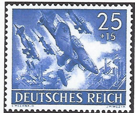
NAZI GERMANY 1934-1945