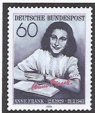
WEST GERMANY 1948-1990