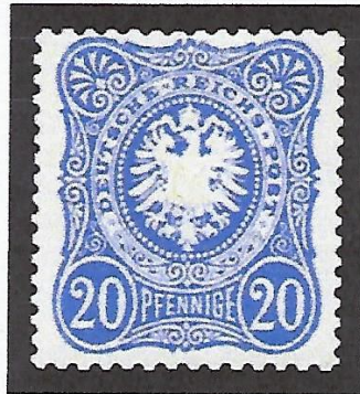
GERMAN EMPIRE 1871-1918