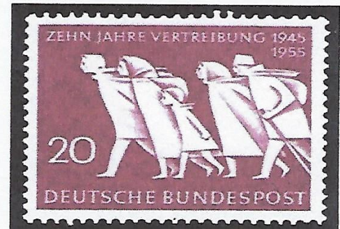
WEST GERMANY 1948-1990