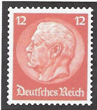
GERMAN EMPIRE 1919-1933