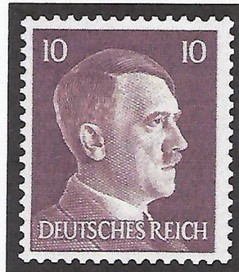
NAZI GERMANY 1934-1945