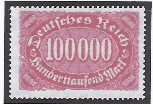
GERMAN EMPIRE 1919-1933