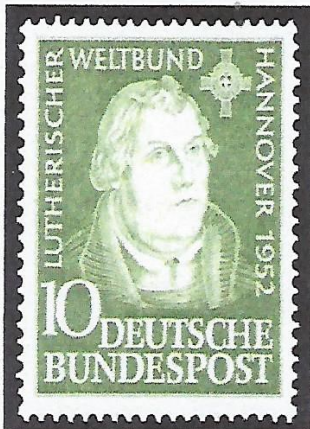
WEST GERMANY 1948-1990