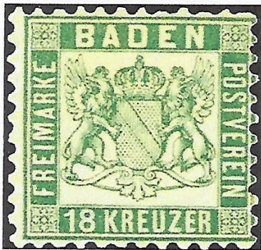
GERMAN STATES (BADEN)