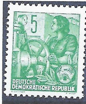
EAST GERMANY 1948-1990