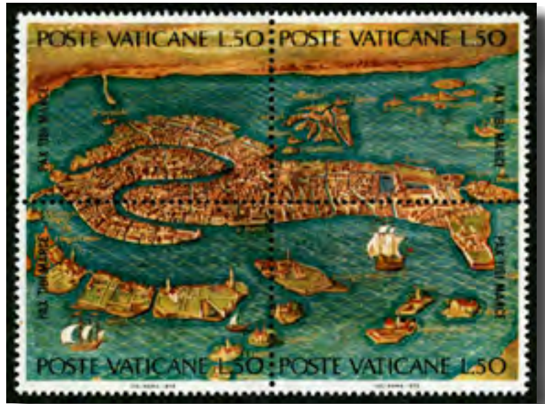
Views of Venice: This block of four stamps, issued in 1972, shows a map of Venice. The issue raised awareness of UNESCO's efforts to save Venice from the waters of the Mediterranean. Below, the Grand Canal and its gondolas.