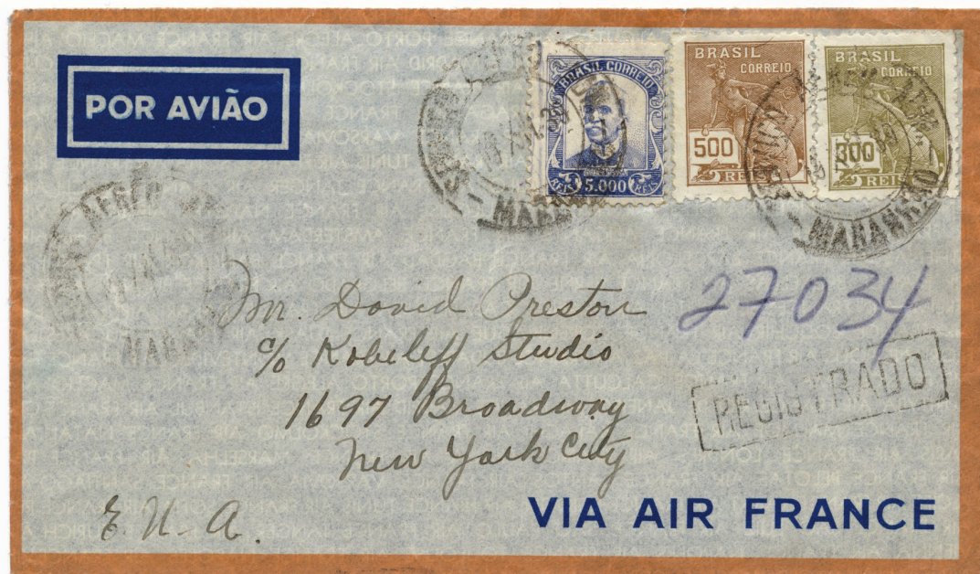
Cover: Author's collection.