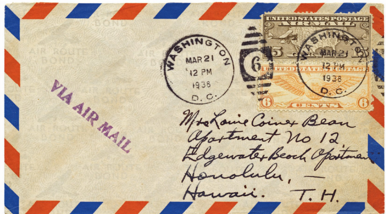
Cover: Author's Collection

It has come to attention that letters prepaid at the regular 3-cent rate only, but enclosed in air-mail envelopes, or envelopes bearing air-mail stickers, or otherwise endorsed to indicate that they are to be dispatched by air mail, are in some instances being accepted and dispatched by air mail. This is not the proper action and may result in loss of postal revenue due to the failure, through inadvertence or oversight, to collect the deficient postage at the office of address. When a letter is deposited for mailing in a distinctive