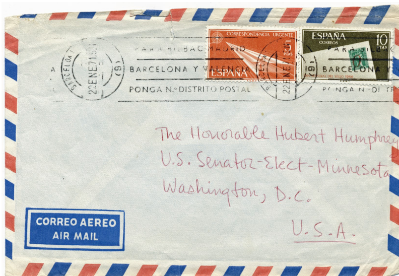
Barcelona to Washington, D.C.: A 5-pta denominated special delivery stamp and a 10-pta World Stamp Day commemorative stamp, both issued in 1966,

That bit of detail is not much to go on to uncover the identity of the sender. Even so .... A quick search reveals a