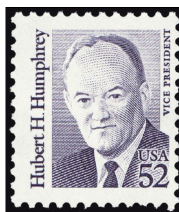
Hubert Horatio Humphrey Jr.: The former vice president and senator appeared on a 52¢ stamp in the Great Americans Series. The U.S. Postal Service issued it June 3, 1991, in Minneapolis, Minnesota. The engraved portrait on the stamp closely follows his official vice-