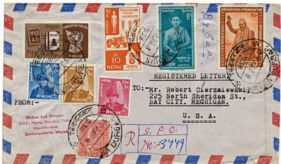
Kathmandu to Bay City: Thirteen face-different stamps tied to the front and back of an airmail envelope by six circular date stamps paid 101 P (Nepalese Paisa) for registered surface mail service from Nepal to Michigan in late December 1964.

I found another cover on Jim Forte’s online store that shows the same red hand-stamped return address for a cover mailed in 1964. 4 Because each cover displays a plethora of stamps and a handstamped return address, I suspect the sender may have been a philatelist. His name and photos appear in a Nepal-focused journal. 5