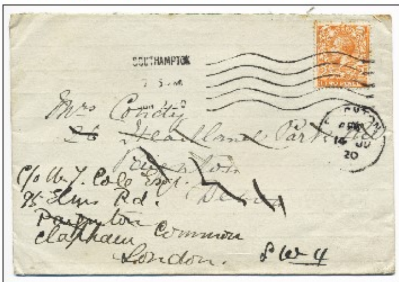
† Southampton to Paignton to Clapham Common, London: The postal clerk's addition of the underlined SW 4 postcode district sent the letter to Clapham.

In addition, the fact that both letters received circular date stamps in Paignton on 14 July 1920 supports