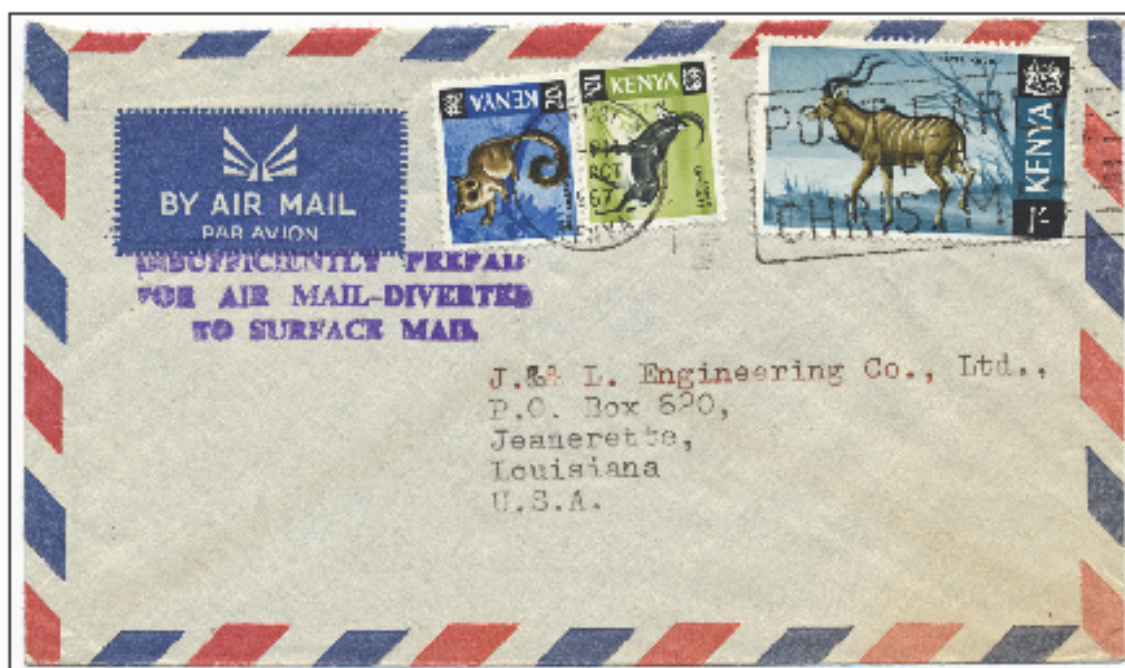
Nairobi, Kenya, to Jeanerette, Louisiana: Three stamps from Kenya's 1966 definitive series paid 1/30 East Africa Shillings for a letter mailed 19 October 1967. The auxiliary marking indicated that the total postage did not match the prevailing air-mail rate to North America.

Thus, the working census of Tanzanian postal covers I have been assembling provides sufficient information to establish that the air-mail letter rate to North America from the countries of the EAPTA for the first weight increment during this period was 2/50. Thus, because the sender affixed postage of 1/30, its franking